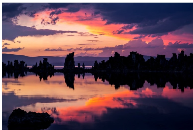
Mono Lake

Mono County, California, is a rural county situated between the crest of the Sierra Nevada Mountains and the California/Nevada border. Accessed by state-designated Scenic Byway US Highway 395 which weaves its way north-south, Mono County is 108 miles in length, and has an average width of only 38 miles. With dramatic mountain boundaries that rise in elevation to over 13,000 feet, the county's diverse landscape includes forests of Jeffrey and lodgepole pine, juniper and aspen groves, hundreds of lakes, alpine meadows, streams and rivers, and sage-covered high desert. The county has a land area of 3,030 square miles, or just over 2 million acres, 94% of which is publicly owned. Much of the land is contained in the Inyo and Humboldt-Toiyabe National Forests, as well as the John Muir and Ansel Adams Wilderness areas. As a result, Mono County offers vast scenic and recreational resources, and has unsurpassed access to wilderness and outdoor recreation and adventure.