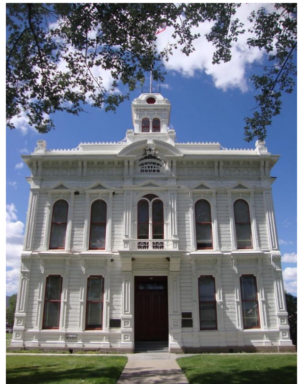
Mono County Courthouse Bridgeport, CA