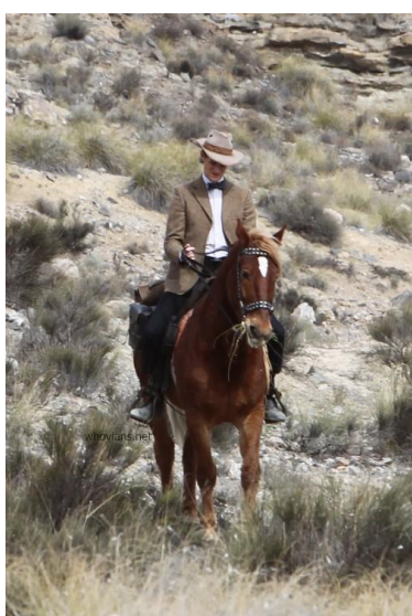
*Who* can be cool enough to commute on a horse with a Bow Tie?

There are 20 questions to this survey and your feedback is crucial! The deadline to complete the Survey is 5:00pm on October 24<sup>th</sup>. Plenty of time for a fairly brief survey.