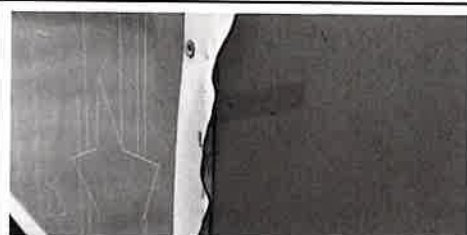
Other's riveted construction with damage

Vote Armor also works to prevent election worker errors. The cambered hang of the access and deposit slot doors allow them to fall open by gravity when unlocked. This prevents the box from appearing secured when it isn't.