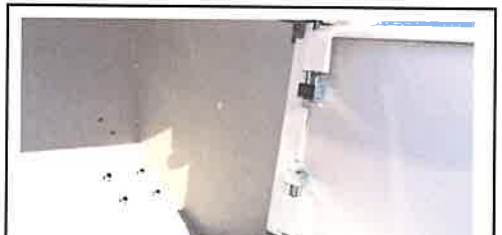
VA-3630 internal hinge and angled hang