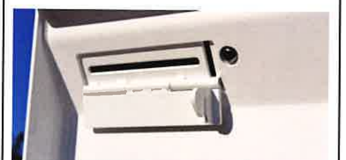
VA-3630 built-in slot door locked open