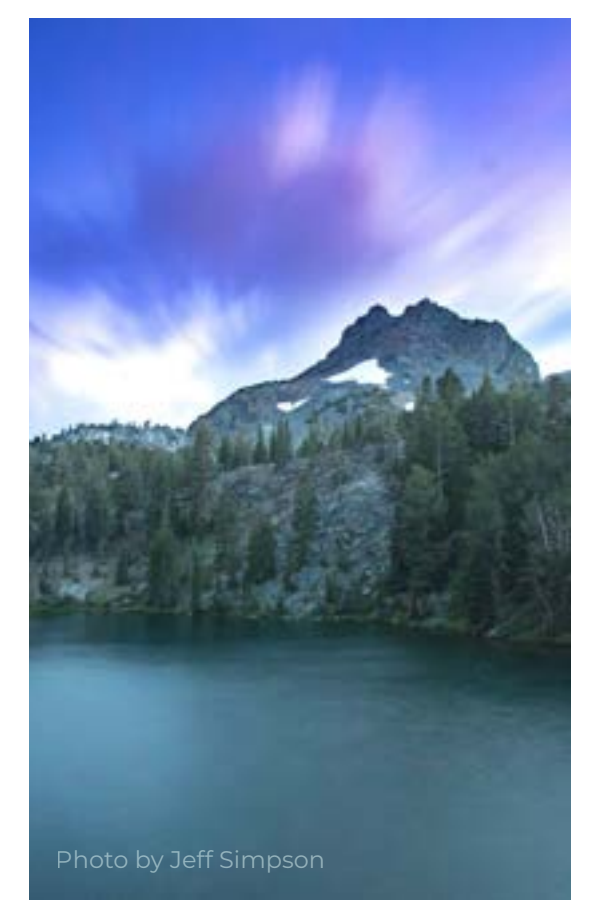
Mono County, California | Housing Coordinator