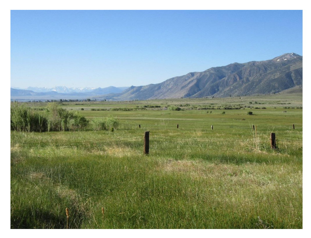
Wet Meadow Ecological Site (R026XF010CA)