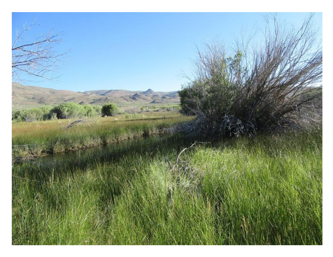
Streambank Ecological Site (R026XF018CA)