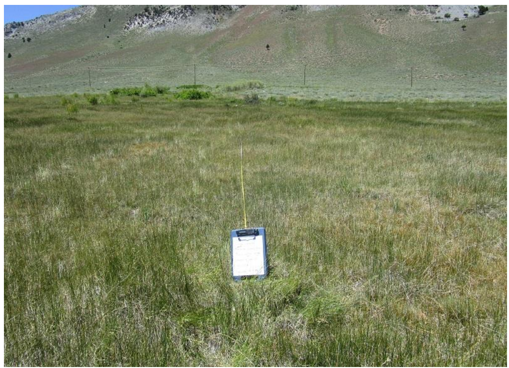
Dry Meadow Ecological Site (R026XY055NV)