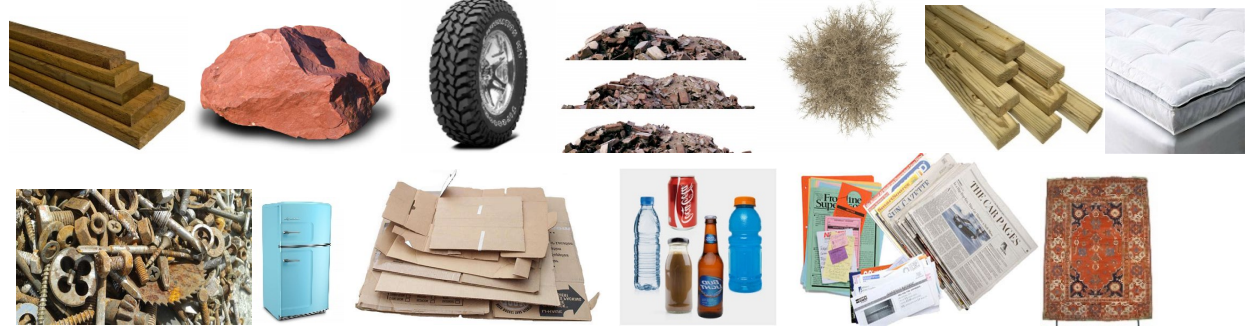
Scrap Metal / White Goods / OCC / Beverage Containers / Mixed Paper / Carpet