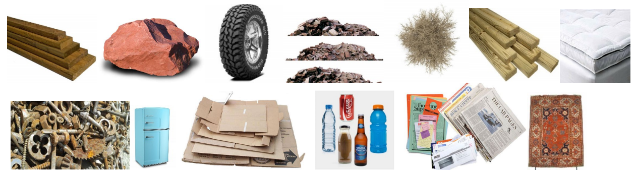
Scrap Metal / White Goods / OCC / Beverage Containers / Mixed Paper / Carpet

Treated Wood/Inerts/Tires/ Recyclable C&D / Clean Green & Wood /Mattresses